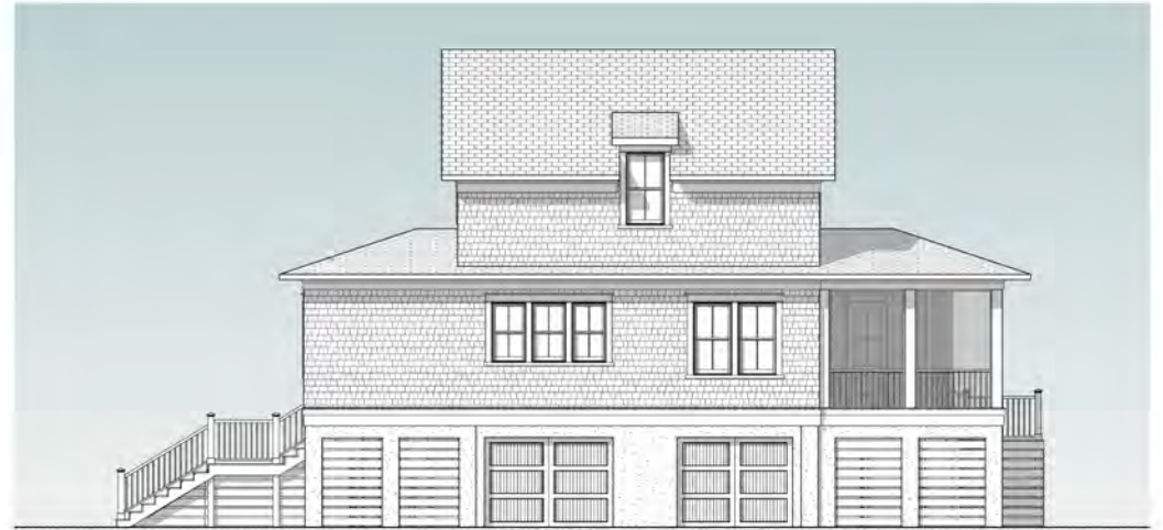
④ Right Elevation

The New Home Collection plans are conceptual only. The developer reserves the right to make changes to the plans or specifications at any time. Copyright © by Live Oak Design Studio LLC. All rights reserved.