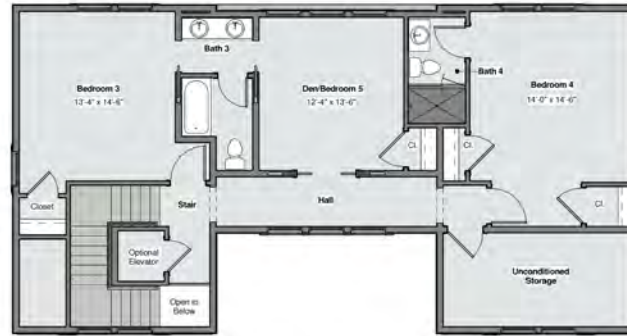
Upper Level Floor Plan