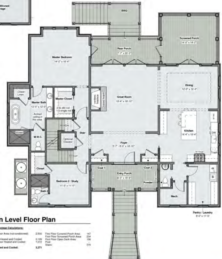
Main Level Floor Plan