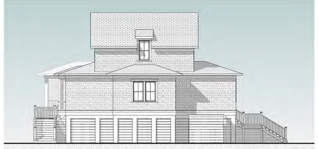
③ Left Elevation