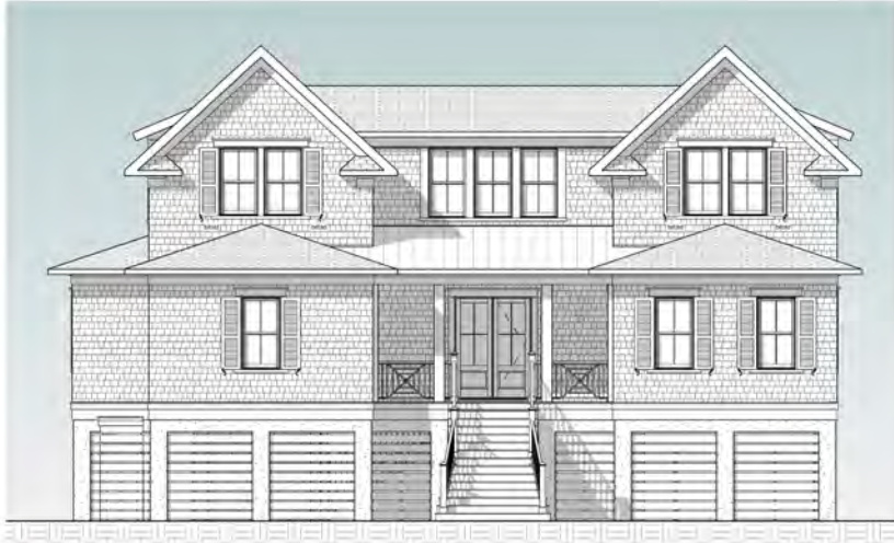
① Front Elevation