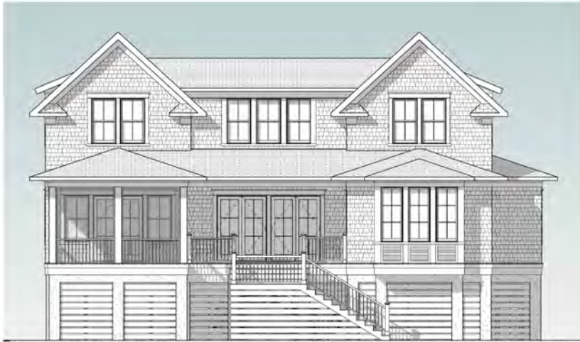
② Rear Elevation